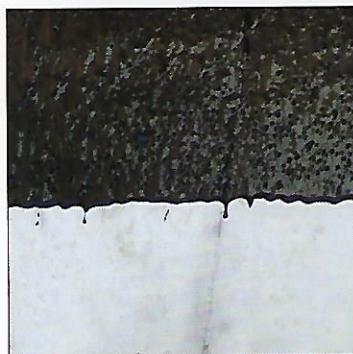
WATCHDOG H3 hangs tough!

With little hang strength, the sagging competitor can't deliver the minimum code-required 40 mils of cured membrane. Equally important, that thin membrane cannot deliver any of their minimal published performance specifications.