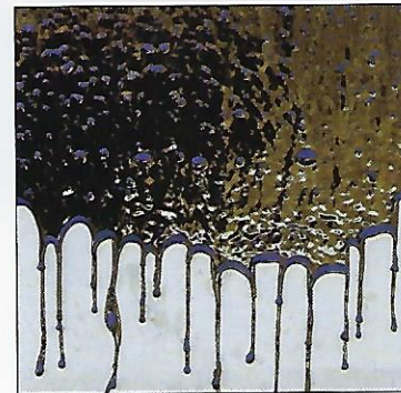
Competitive product slides away!