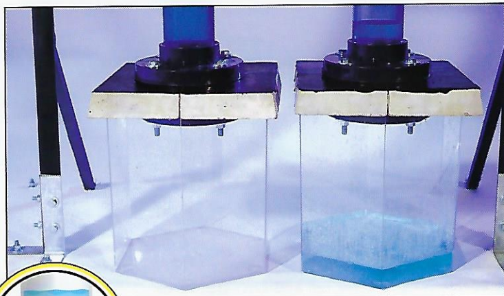
WATCHDOG H3 No Leaks!